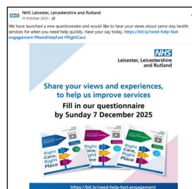
2 Example Facebook post