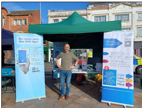
3 Leicester Communities Together Information and Advice Festival