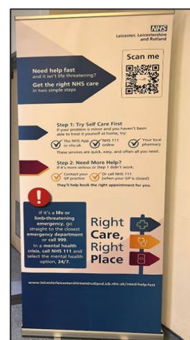
1 Example pull up banner