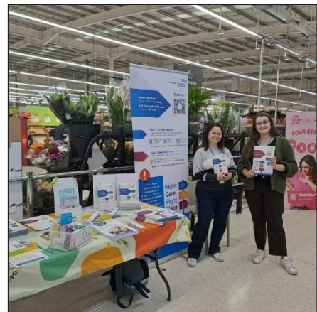
4 Asda Thurmaston